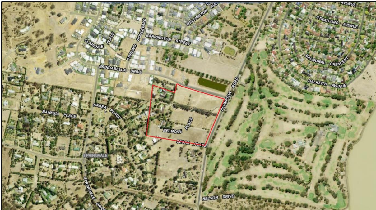
Figure 2: Aerial photograph of the site and surrounding area