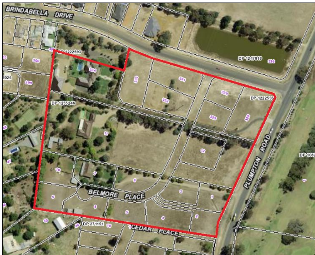
Figure 1: Aerial photograph of the site

As shown in Figure 1 , the site comprises a mixture of undeveloped lots and three existing dwellings. Vegetation cover on the site is limited to the areas surrounding existing dwellings and along fence lines and existing internal accesses.